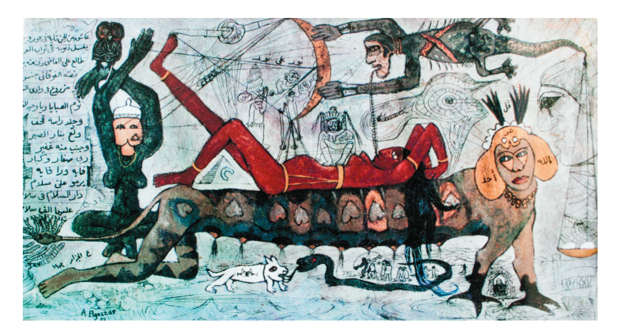
Figure 1. Abdel Hadi Al-Gazzar, Un djinn amoureux , 1953. Gouache and india ink on paper, 53 by 28 centimeters. From the Collection of the Museum of Fine Arts, Alexandria