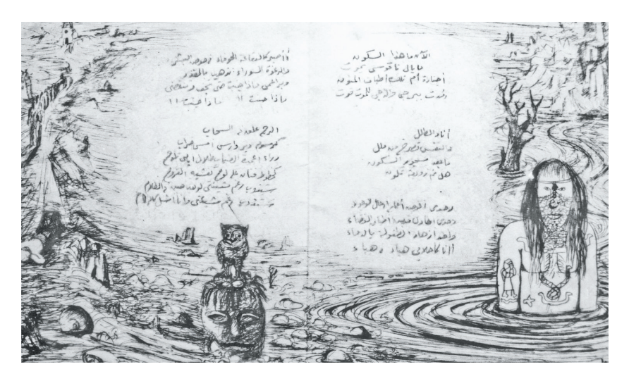
Figure 7. Abdel Hadi Al-Gazzar, Now What Is This Silence ? 1954. Colored crayon on paper, 34 by 21.5 centimeters