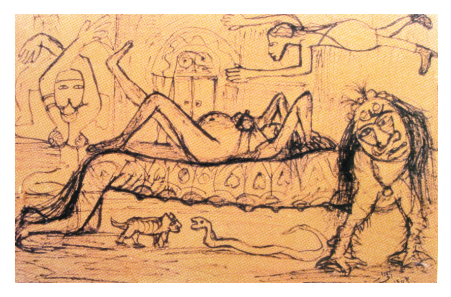
Figure 2. Abdel Hadi Al-Gazzar, Un djinn amoureux preparatory drawing, 1953. India ink on colored cardboard, 34.5 by 22.7 centimeters