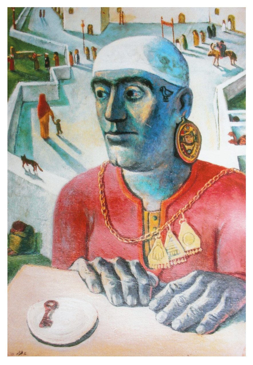
Figure 3. Abdel Hadi Al-Gazzar, The Past, the Present, and the Future , 1951. Oil on cardboard, 62 by 95 centimeters