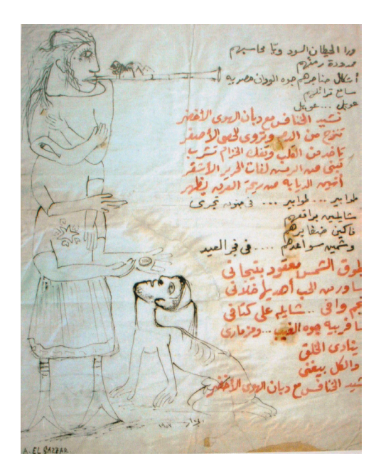
Figure 4. Abdel Hadi Al-Gazzar, The Hymn of the Beetles , 1953. Colored crayon on paper, 48 by 62 centimeters. From the collection of Gazebia Seri