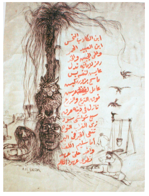
Figure 5. Abdel Hadi Al-Gazzar, The Damned Son of a Bitch , circa 1953. Ink on paper, 36 by 48 centimeters. From a private collection